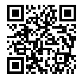
also through your local Barnes & Noble, Target, Walmart, bookstores everywhere...ask for it.